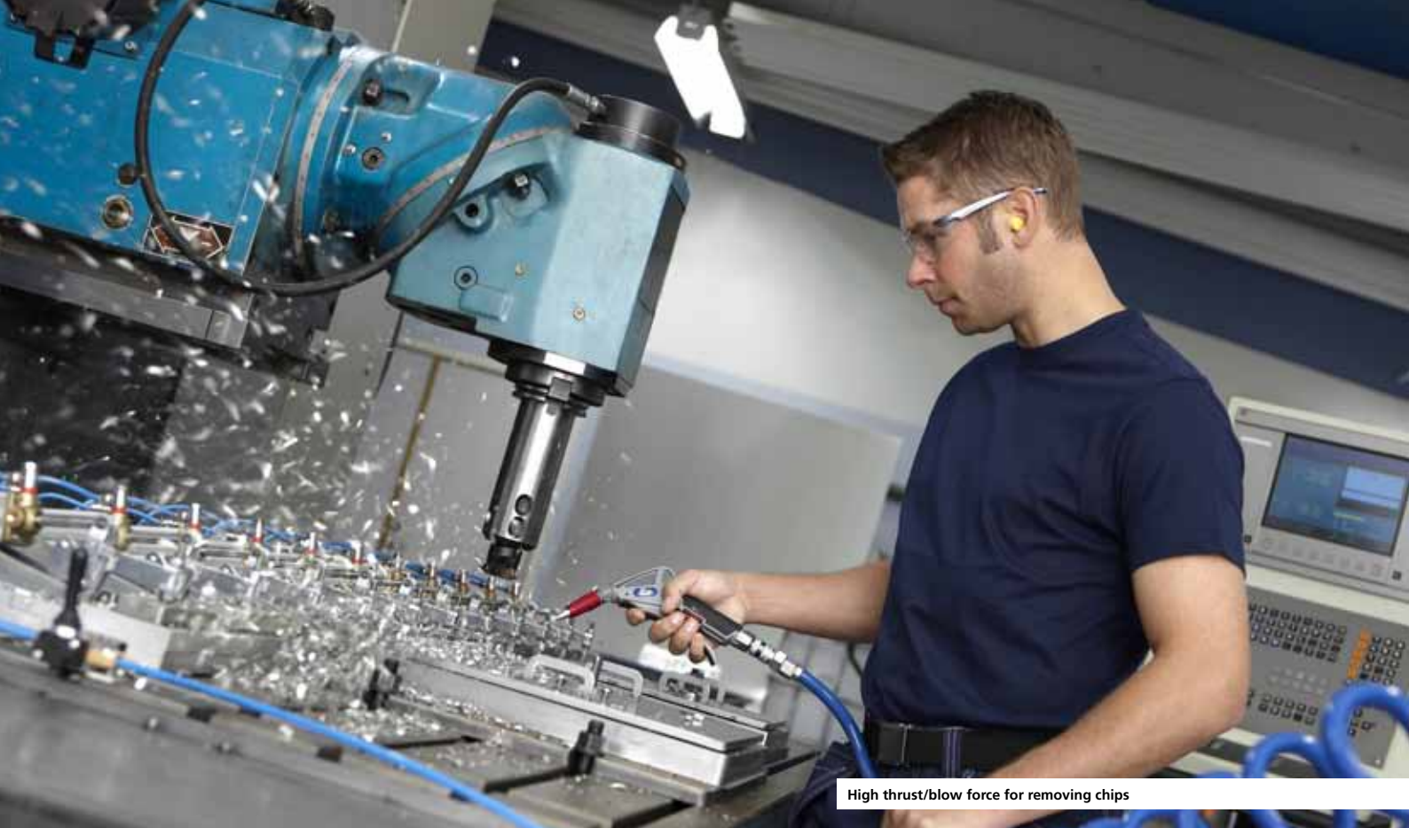
High thrust/blow force for removing chips