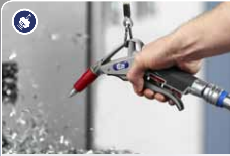
Air and fluid flow