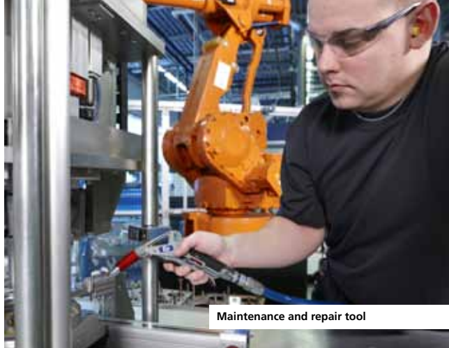
Maintenance and repair tool