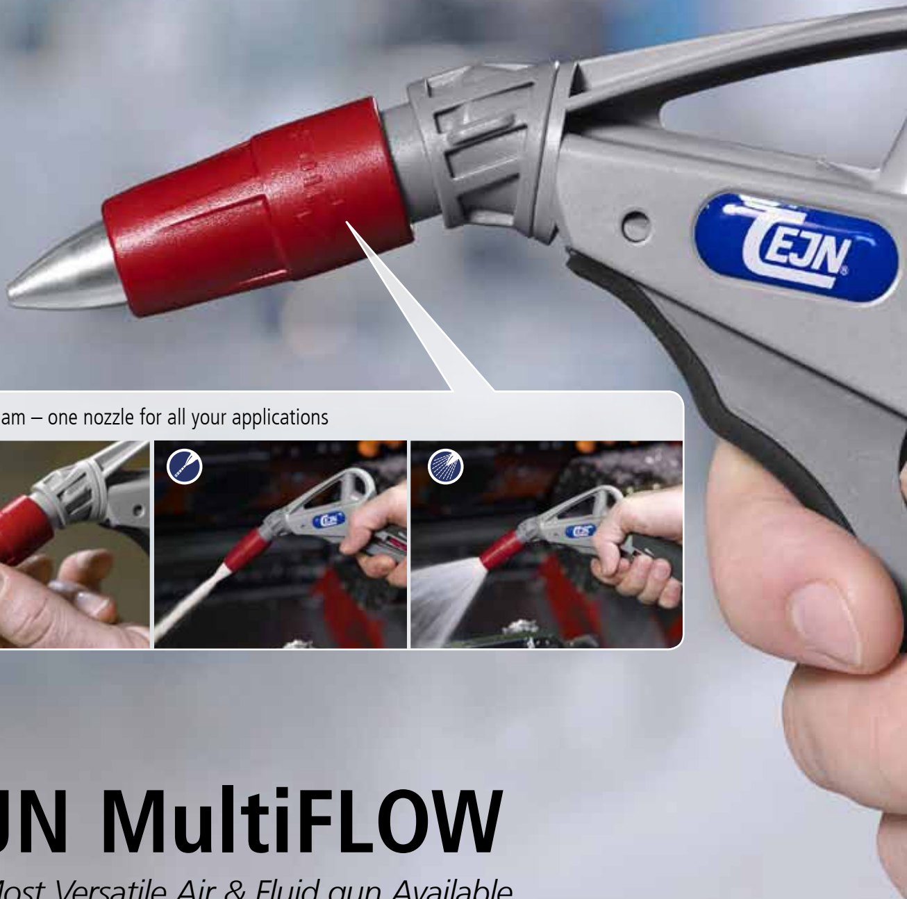
Adjustable beam – one nozzle for all your applications