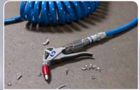
Withstands rough environment