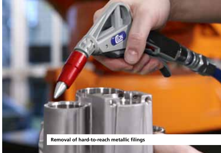
Removal of hard-to-reach metallic filings