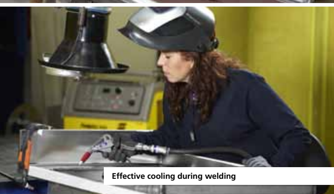
Effective cooling during welding