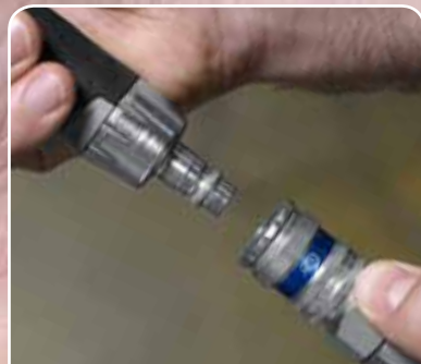
Low disconnection noise