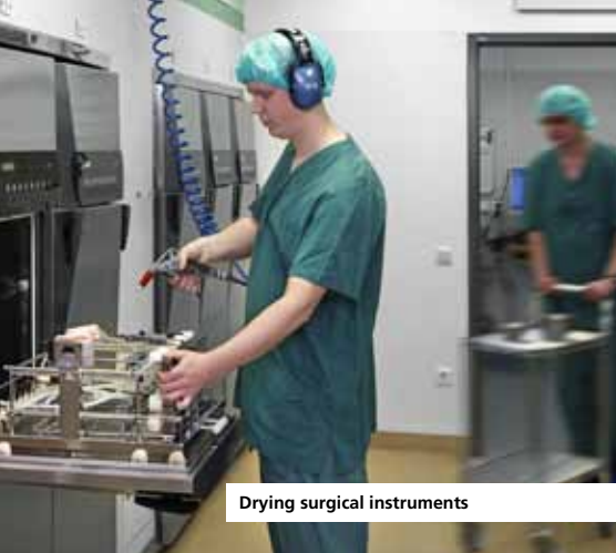
Drying surgical instruments