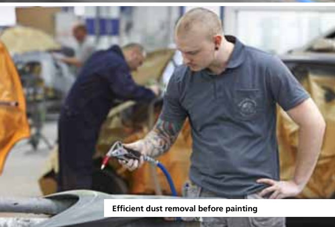
Efficient dust removal before painting