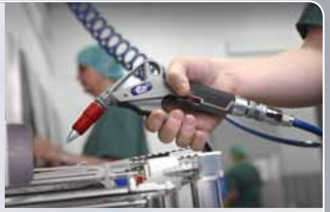
Extreme flow for cleaning, cooling and drying