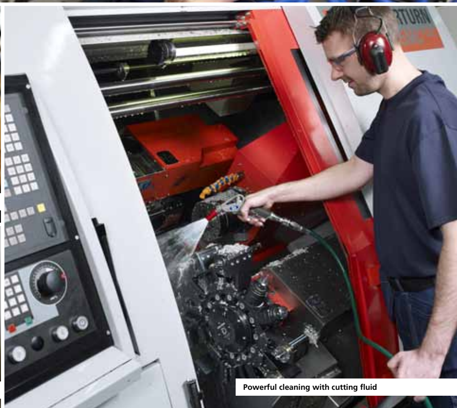
Powerful cleaning with cutting fluid