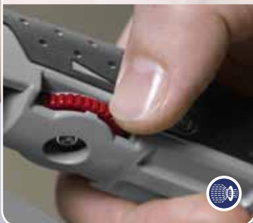
Adjustable flow for specific application needs