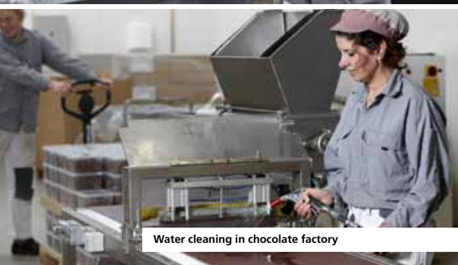
Water cleaning in chocolate factory