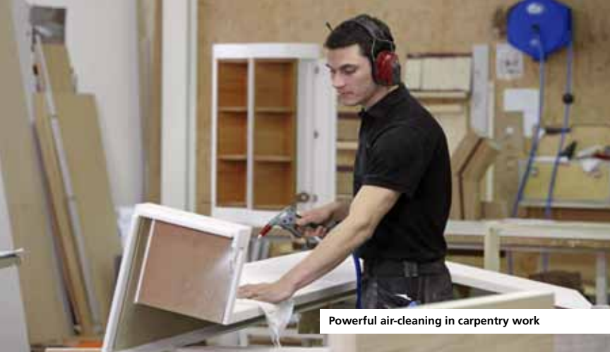
Powerful air-cleaning in carpentry work